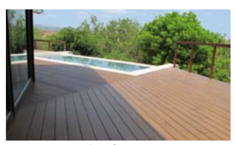
golf club | Cape Town