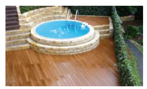
private house | Dresden