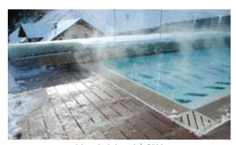
outdoor hotel pool | Sölden