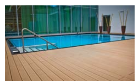
hotel pool | Kitzbühel