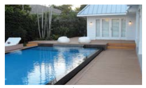
private villa | Key Biscane

All the very exceptional properties make Resysta extremely resistant to weather influences like sun, rain, snow and ice, salt- and chlorine-water. Resysta does not swell, crack, splinter or rot. This we guarantee for 15 years.